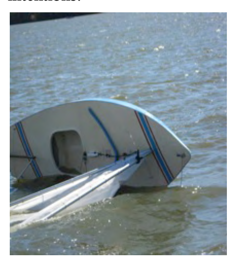
Don Fecher's duty

boaters. Change course if it looks like others are unsure or anxious about your intentions.