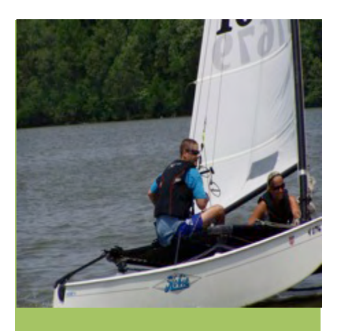
"If in doubt, let them out."

"Get clear air, maintain clear air, stay in clear air."